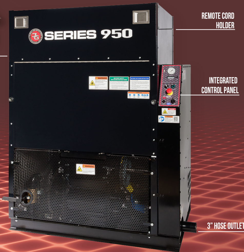
REMOTE CORD HOLDER