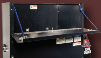
DROP DOWN LOADING SHELF